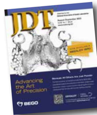
Faux Cover Example

Classified Line Ads are $100 for the first 25 words, and $1.50 for each additional word. Discounts for Classified Line Ads: JDT offers a discount of 5% for three consecutive insertions, 10% for six insertions and 15% for nine insertions.